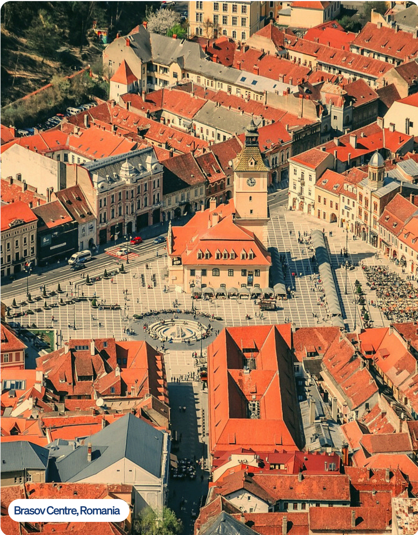
Brasov Centre, Romania